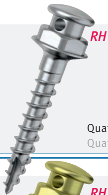
Quattro RH micro pro Quattro RH micro pro